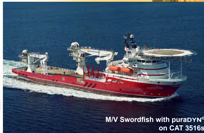
M/V Swordfish with puraDYN ® on CAT 3516s