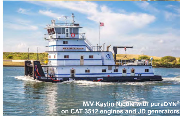
M/V Kaylin Nicole with puraDYN ® on CAT 3512 engines and JD generators